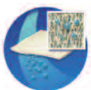
4. Solvent dehydration