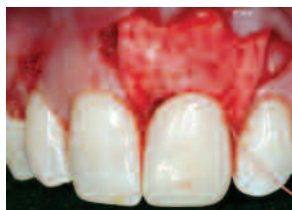
Fig. B Puros Dermis surgically placed.