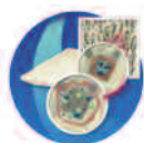
2. Oxidative treatment