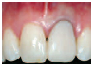
Fig. A Preoperative: clinical view.