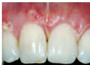
Fig. C 10-day postoperative: note excellent soft tissue integration.