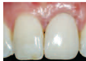
Fig. D 30-day postoperative: note esthetic tissue blending and color match.

Individual results may vary.