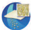
1. Osmotic treatment

The Puros Allograft family of products is refined using the proprietary, 5-stage Tutoplast sterilization process. While preserving the valuable collagen matrix and tissue integrity, this process gently removes unwanted materials such as cells, antigens and viruses, as well as inactivates pathogens. Tutoplast -Processed tissues have been used for over 30 years in more than one million procedures without a single reported case of disease transmission.