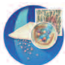
3. Alkaline treatment