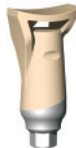
Contour Impression Cap seated on a Hex-Lock Contour Abutment.